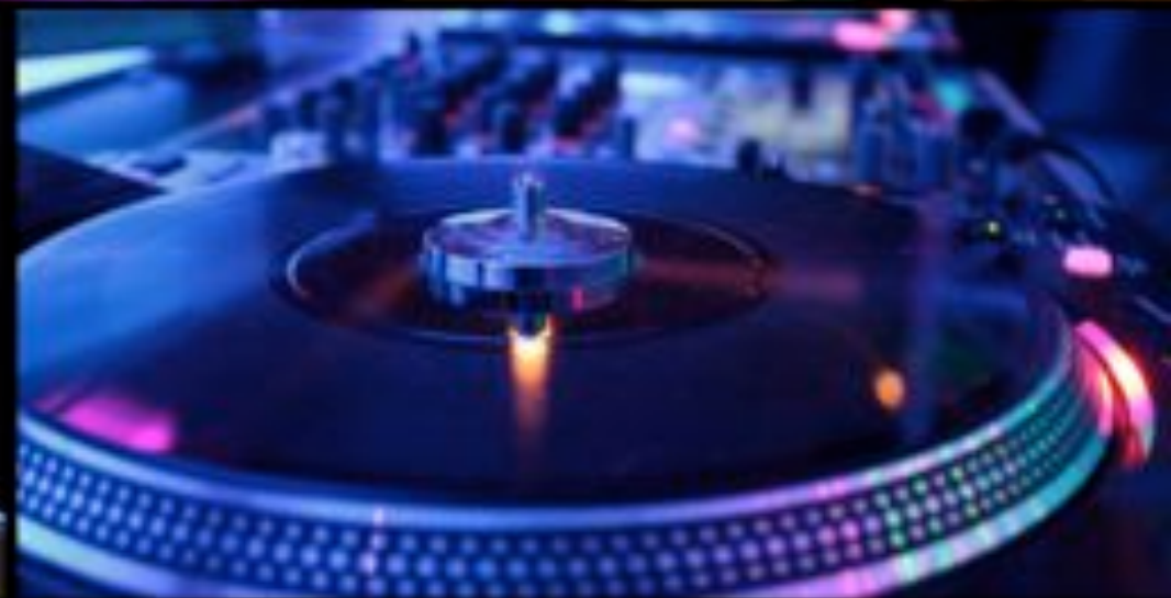
High Tech Digital Sound System