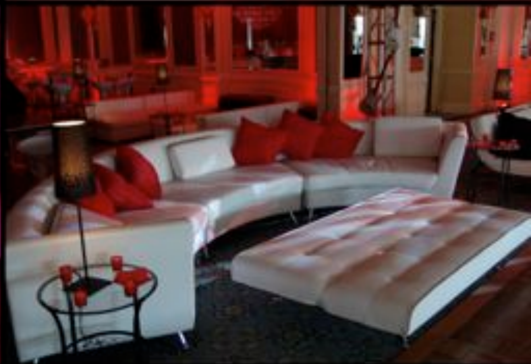
EVENT LOUNGE FURNITURE