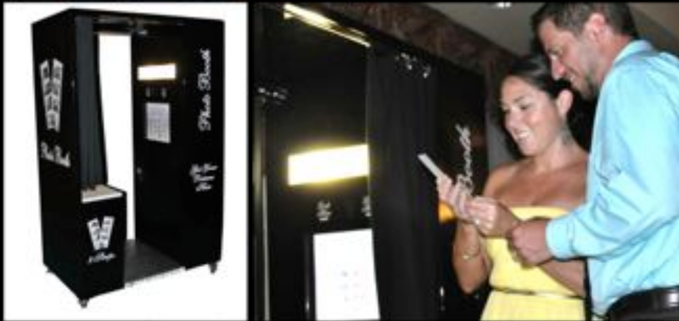
THE PHOTO BOOTH