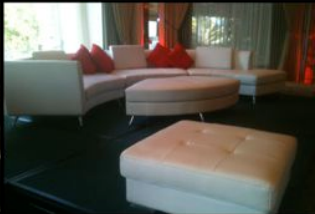
EVENT LOUNGE FURNITURE